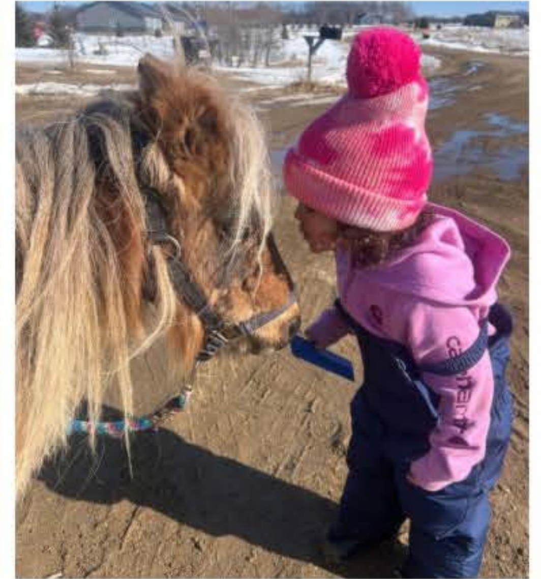
Our pony getting some love