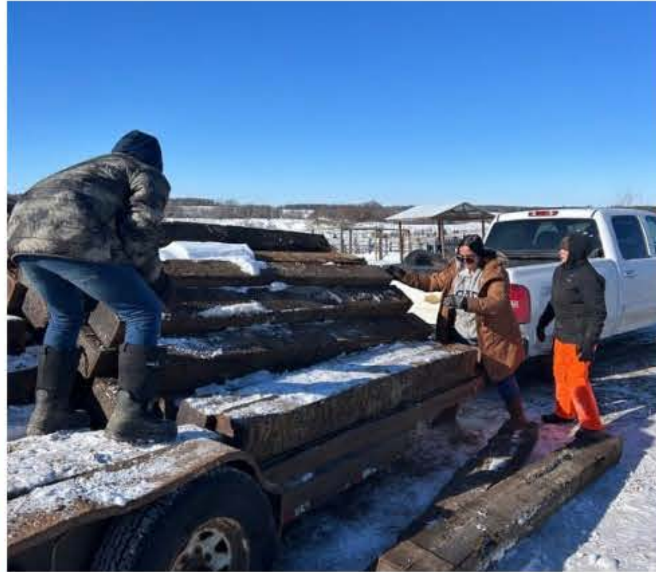
We were able to buy RR ties for future fencing