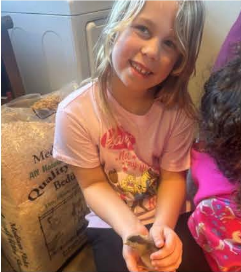
Baby chicks and ducks - feels like Spring!